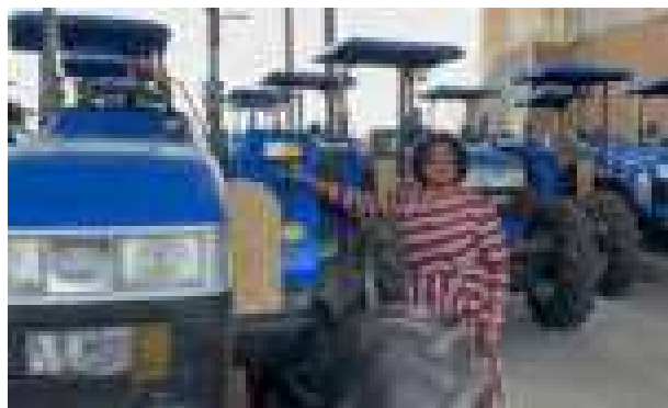
Photo: Graduation of Farm Machinery Operators from all regions, meant to operate newly procured agricultural machineries