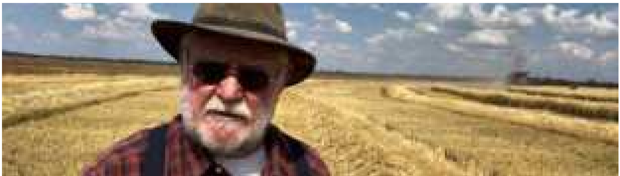
Photo: Hon. Carl Schlettwein visiting an Irrigation plot located at the Otjozondjupa Region