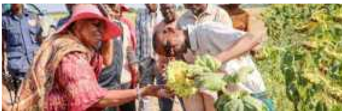
Photo: Namibia Vice President Hon. Netumbo Nandi-Ndaitwah inspecting sunflower production at the Shadikongoro Green Scheme due to be harvested in few weeks

The Ministry has resuscitated the Sunflower Production Project by planting 40 ha at Sikondo and Shadikongoro Green Schemes to be processed at Shadikongoro Oil Processing Plant in the coming weeks. These projects are envisaged to grow by accommodating out-growers from neighbouring communities to contribute to sunflower oil production.