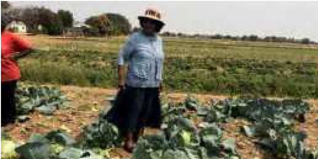
Photo: Hon. Anna Shiweda inspecting crop production at Etunda Green Scheme

11.2 This Programme is at the core of the food and nutrition security objectives, but also the provision of field-based services to enhance increased agricultural production and productivity. It is important to highlight that this Programme has a high job content when the enabling infrastructure and support services are optimally set up.