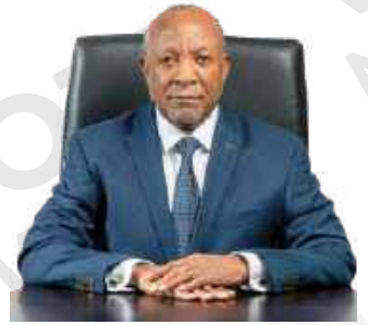
H.E. Nangolo Mbumba