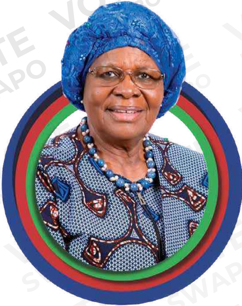
Cde Dr. Netumbo Nandi-Ndaitwah