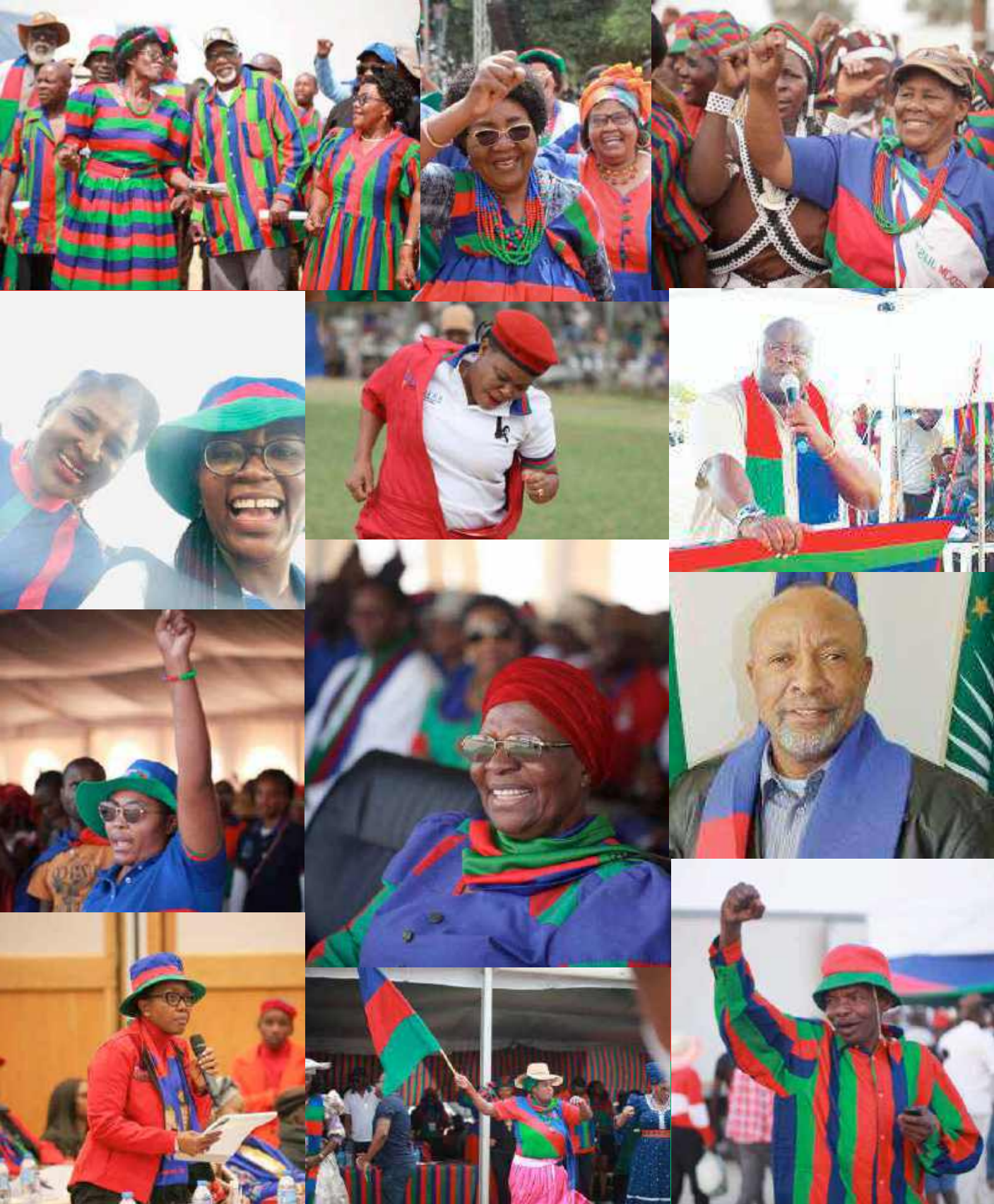
The Vice President and the Secretary General meet the People