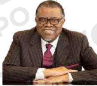
H.E. Hage G. Geingob