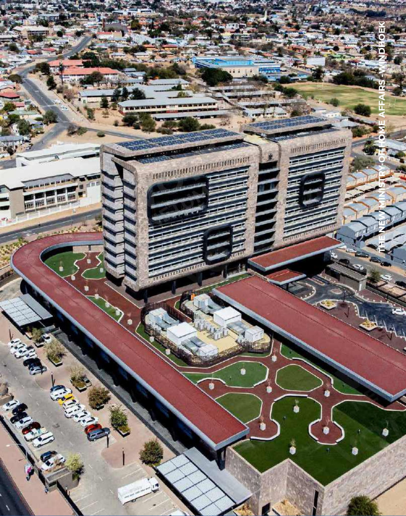
THE NEW MINISTRY OF HOME AFFAIRS - WINDHOEK