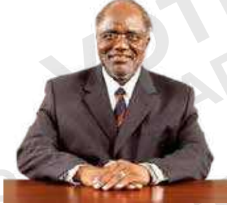
H.E. Hifikepunye Pohamba