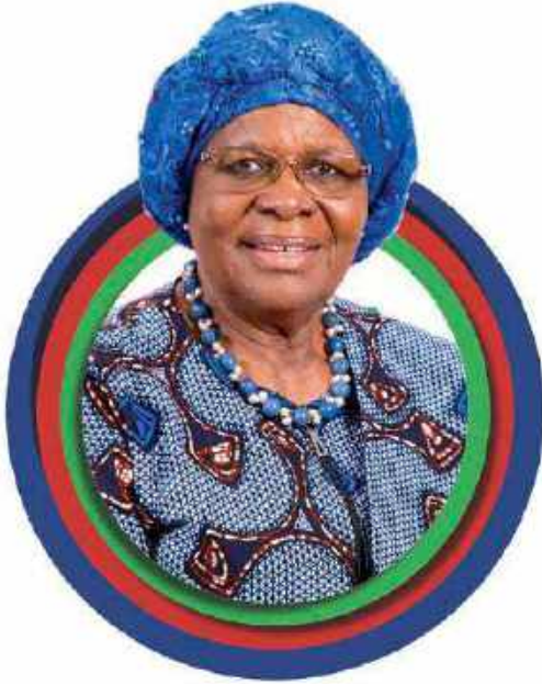
Cde Dr. Netumbo Nandi-Ndaitwah

As the Vice President of our Mighty SWAPO Party, I am sincerely humbled to present this SWAPO Party Elections Manifesto to our Nation through which we seek a renewed mandate. These 2024 elections come when we are still mourning the untimely departure of our Party President and Namibia's 3rd President, H.E. Dr. Hage G. Geingob.